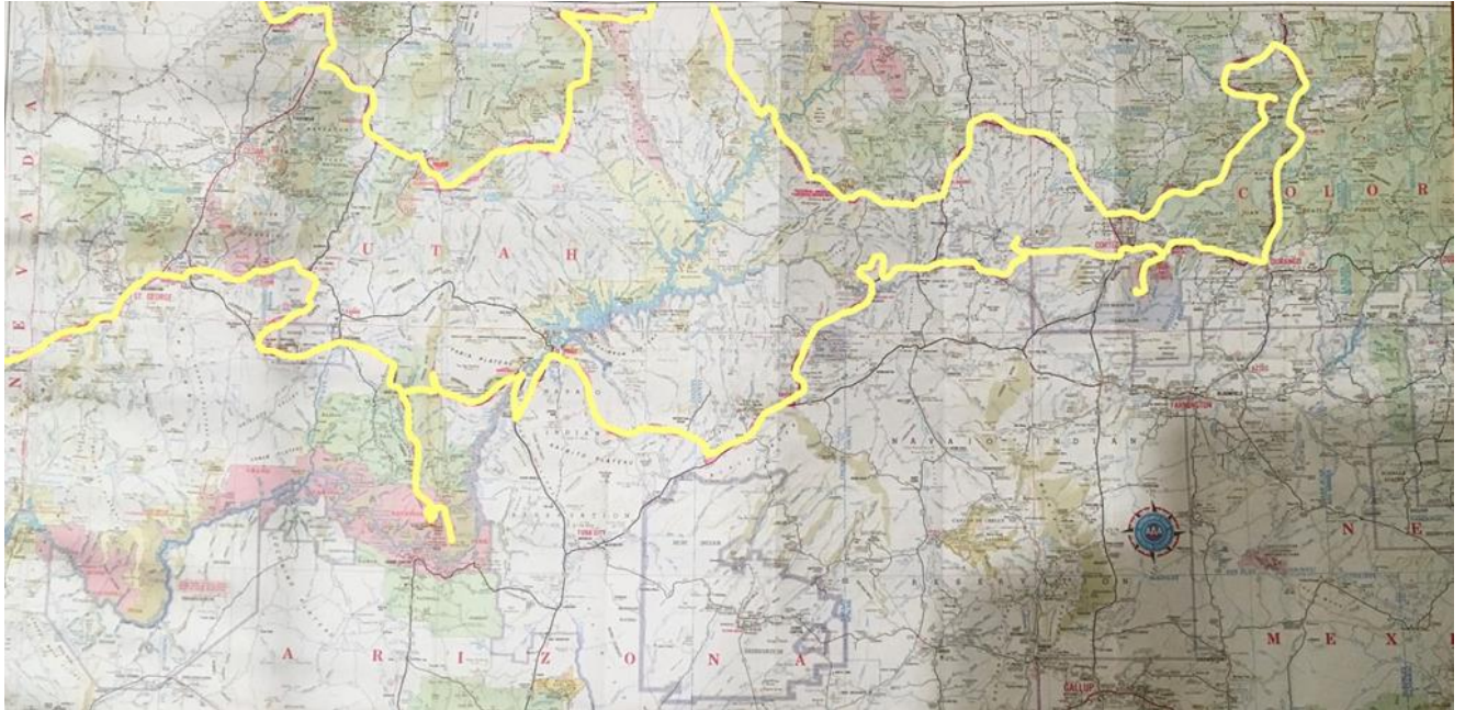
On the Road with Rhodies - Southwestern Sojourn